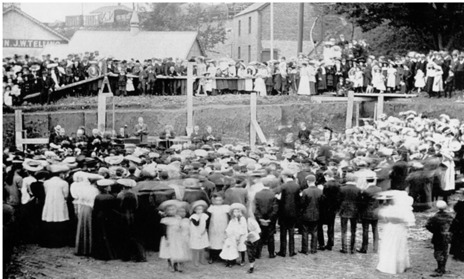
Laying of the foundation stone (17th July, 1906).