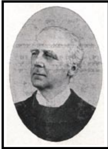
Rev. F.B. Meyer B.A. President of the Baptist Union who laid the Memorial Stone on 14th November 1906